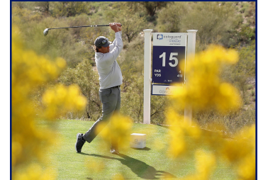
Hole Sign- $1,000

Showcase your brand in a highly visible setting. Tee backs are visible on the backside of every hole at La Paloma Country Club.