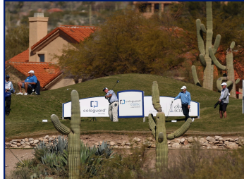
Tee Back- $3,500

Be apart of the tournament by having your logo included with the tournament logo on koozies. Koozies will be given out at concessions and hospitality venues.